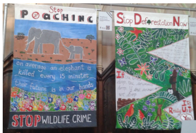
Banners made by Year 5 and 6 for a Community Art Project

As part of our Health Education programme Whimble School operates a total no smoking policy on the school premises. The Governors of the school have passed a resolution to this effect.