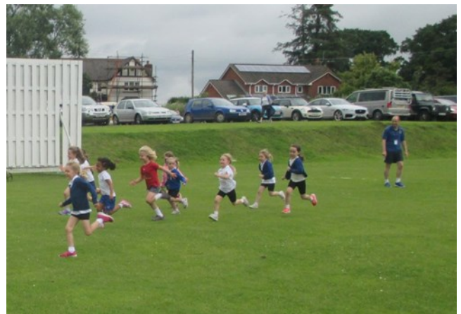
Sports Day at the cricket field.

School back-packs are available from the School Office.