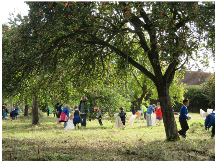
Apple Picking at 'The Orchard'

e-mail: admin@whimble-primary.devon.sch.uk