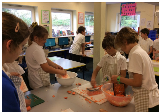
Cookery (part of 'Fantastic Friday')

Some children need a snack at mid-morning break. The school discourages sweets and chocolate; and chewing gum is not allowed. Healthy snacks can be bought from the School tuck shop.