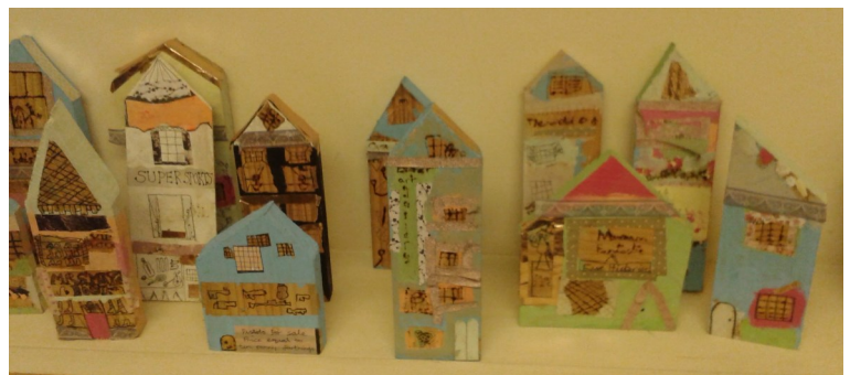
Year 4 Arts Project