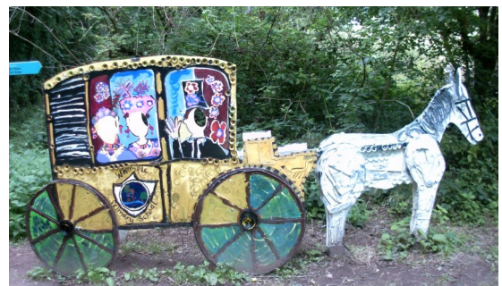
Local Learning Community Arts Project with Killerton

https://whimple-primary.eschools.co.uk/website/policies/93239