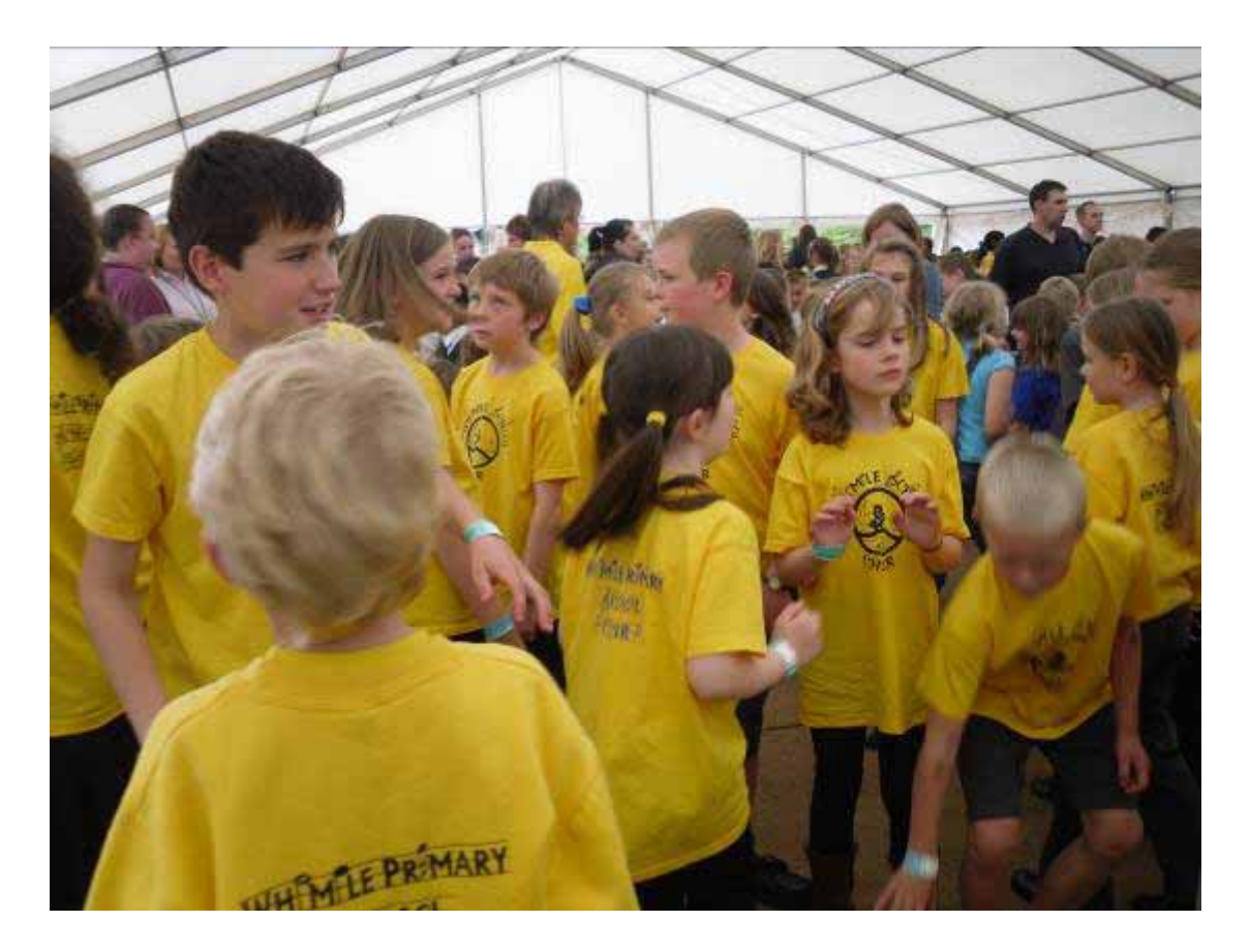
Dancing at the ceilidh workshop.