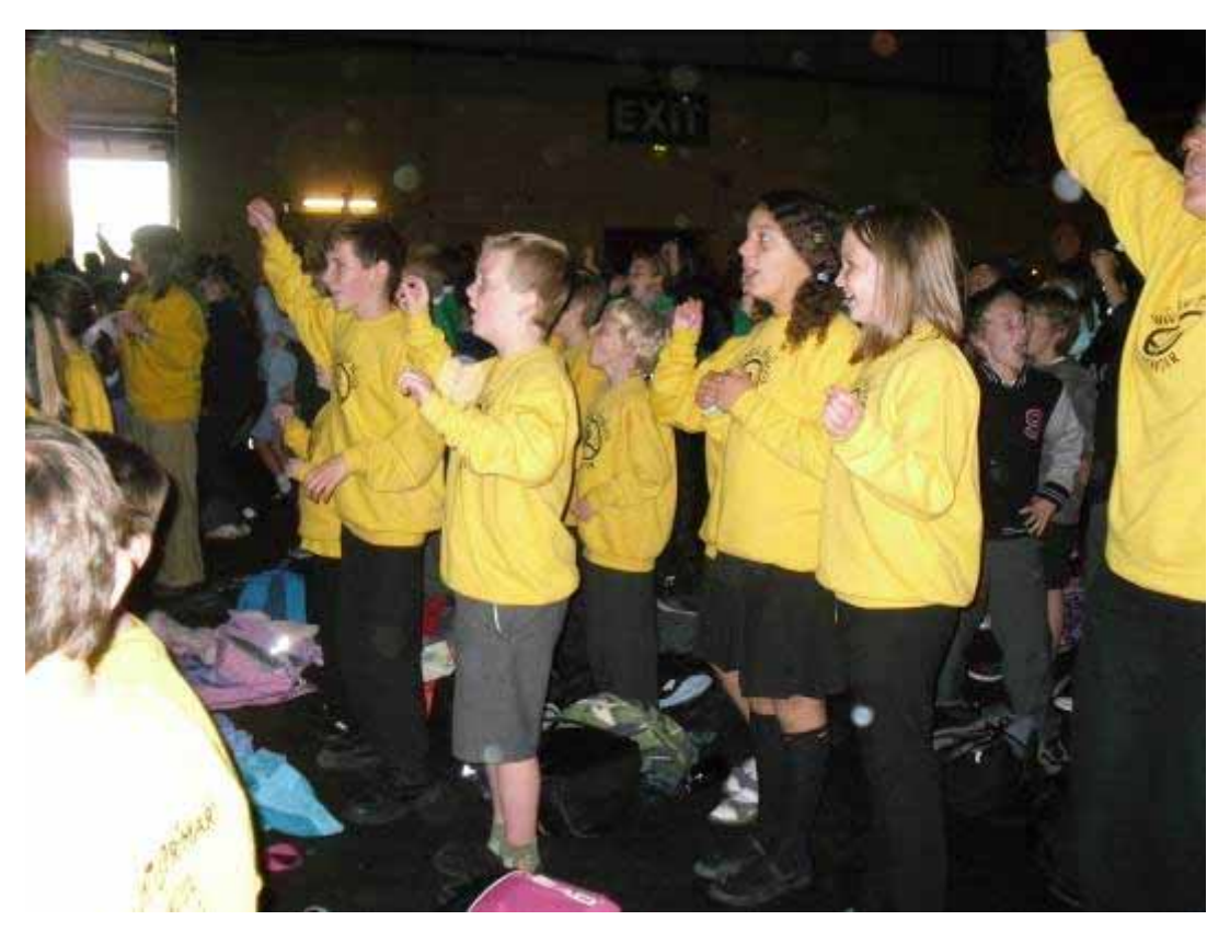
Dancing to Bhangra with children from across Devon.