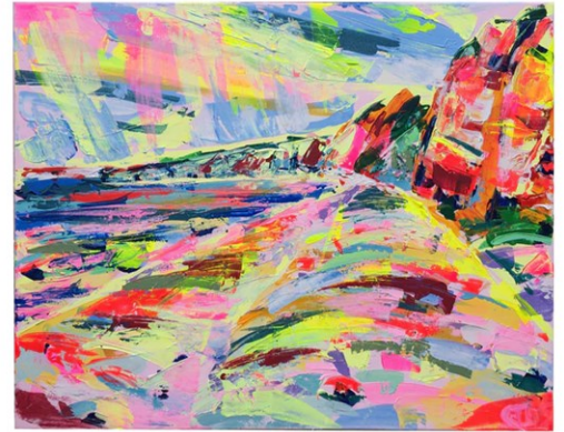
Budleigh Salterton by Chloe Tinsley

The pupils in Beech Class have also had two more Forest School sessions as well. During the first one, they made animals out of clay as their structured activity and they also enjoyed creating dens out of found objects and natural materials. All the pupils benefitted from spending time in nature and found it interesting to explore the orchard area to see what was growing again this spring time.